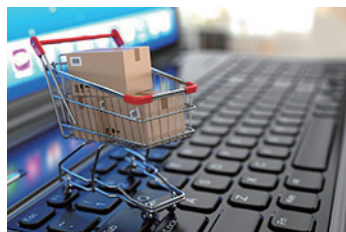
(Digital) Browsing photos or movies of products and shopping through websites or apps.