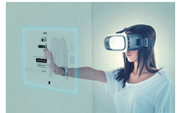
(Virtual) Interacting with products and shopping from anywhere through VR.