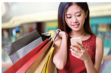
(Real) Looking at products directly and shopping at stores.

This redefines the customer experience with new capabilities, like visiting virtual stores to check on the quality of products that aren't stocked in physical stores, or seeing how a product will look in their own home.