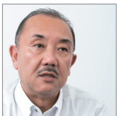
Leader Business Process Group Management Information System Department Management Information System Headquarters Yokogawa Electric Corporation

"ABeam has a global network and its overseas members provided fully-fledged support, so we were able to introduce the YGS system in multiple regions simultaneously."