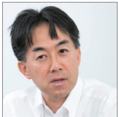
General Manager Management Information System Department Management Information System Headquarters Yokogawa Electric Corporation