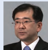
Vice President Deputy Division Director Global Project Management Division

“This time, we broke down our existing business process that had been used for many years and reconstructed it the optimal way, so we had to prepare for resistance to operational reforms. Business partners were also required to have some degree of readiness and understanding. We judged that ABeam Consulting was capable of promoting the project as a competent coordinator among various departments.”