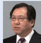
Executive Director General Manager IT Management Unit Global Project Management Division

“ABeam Consulting helped build the system while recognizing our goals, exceeding the boundaries between user and consultant. They took the leadership especially in solving problems, which was extremely helpful for us both during installation in Qatar and after starting our operations.”