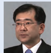
Vice President Deputy Division Director Global Project Management Division

“This time, we broke down our existing business process that had been used for many years and reconstructed it the optimal way, so we had to prepare for resistance to operational reforms. Business partners were also required to have some degree of readiness and understanding. We judged that ABeam Consulting was capable of promoting the project as a competent coordinator among various departments.”