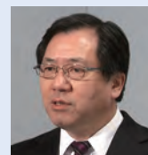
Executive Director General Manager IT Management Unit Global Project Management Division

“ABeam Consulting helped build the system while recognizing our goals, exceeding the boundaries between user and consultant. They took the leadership especially in solving problems, which was extremely helpful for us both during installation in Qatar and after starting our operations.”