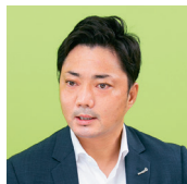
Manager Sales & Marketing Department Sales Marketing Solaseed Air Inc.