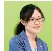
Sales & Marketing Department Sales Marketing Solaseed Air Inc.