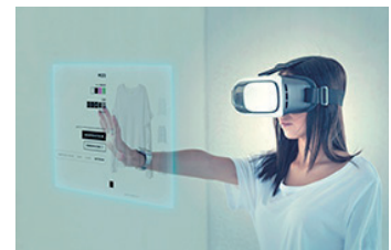
(Virtual) Interacting with products and shopping from anywhere through VR.